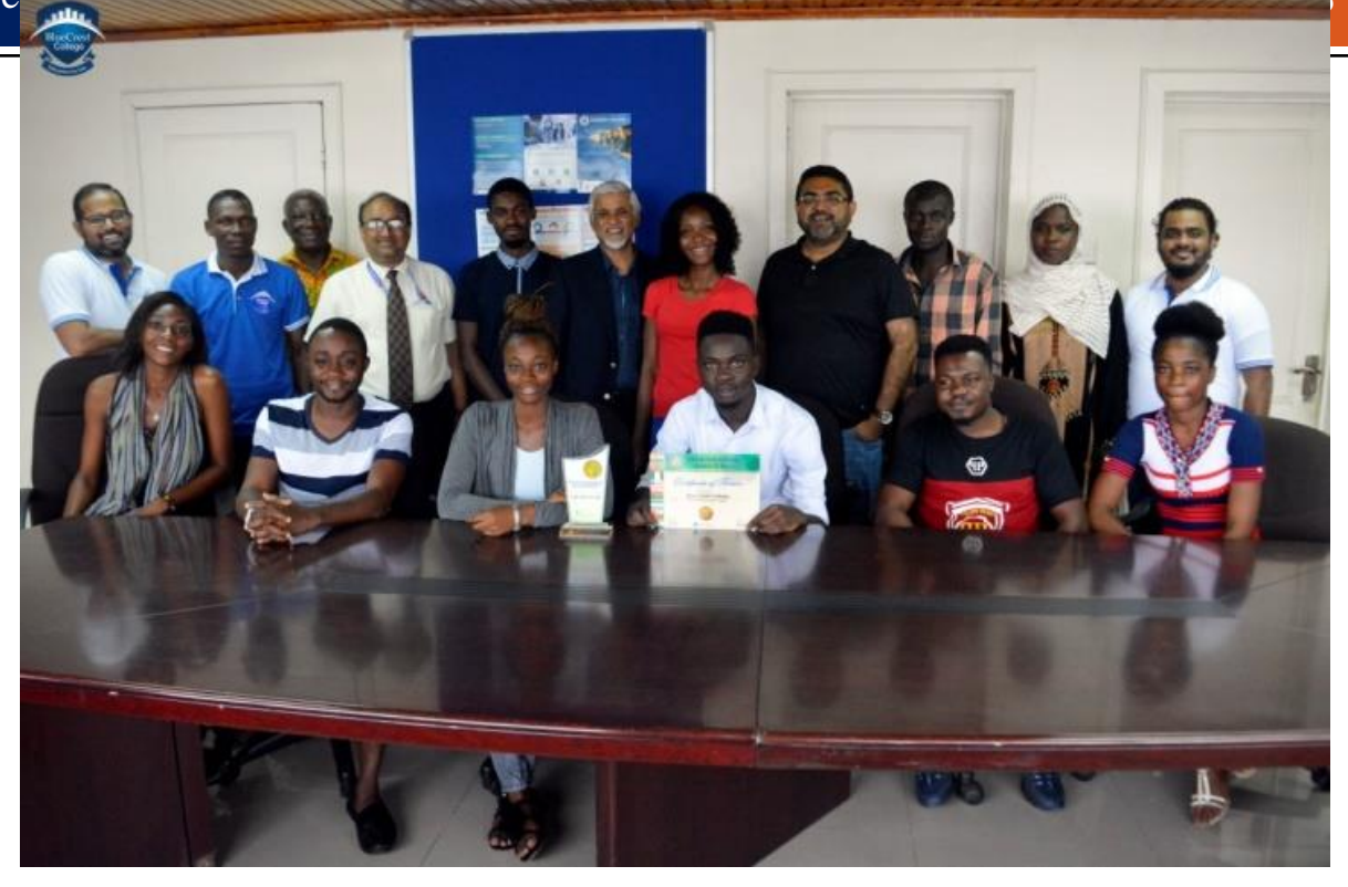
Best Private Journalism College in Ghana